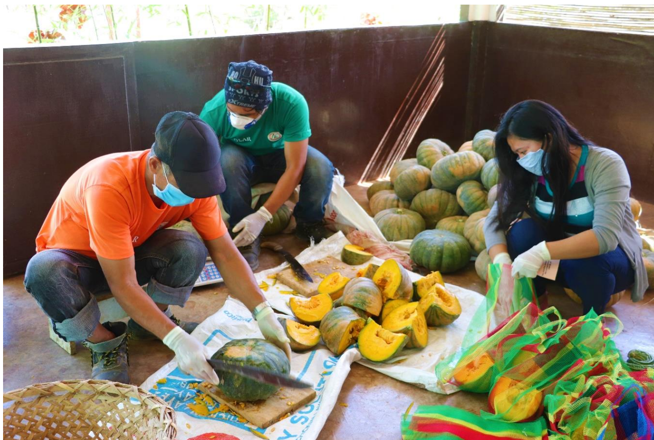
Agata employees pack vegetables for relief distribution in Agusan del Norte as part of its COVID-19 initiatives. The company sourced vegetables from host Santiago Municipality's farmers in order to support local livelihood.

Agata programs benefit some 10,000 families and 4,000 scholars