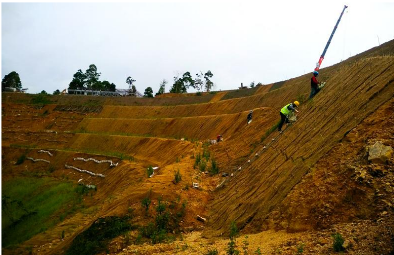
6 A slope protection mechanism is maintained at the mine site to prevent soil erosion and potential landslides.