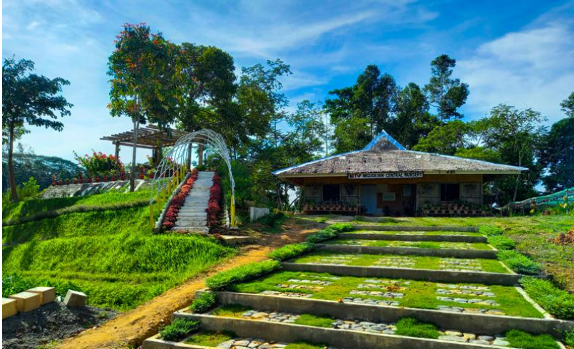
5 Different species of plants for rehabilitation are cared for by professional foresters and locals at TVIRD's Nursery.