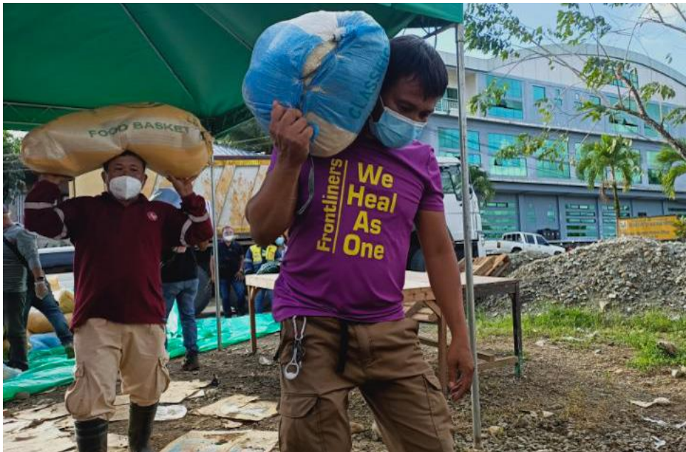
1 Together we rise. Employees of Agata deliver relief goods, which were turned-over to local government units and directly to the residents themselves.