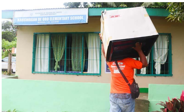
1 A new normal. Agata's Barangay Liaison officer delivers a donated photocopier machine to Agata's partner school in Barangay E. Morgado.