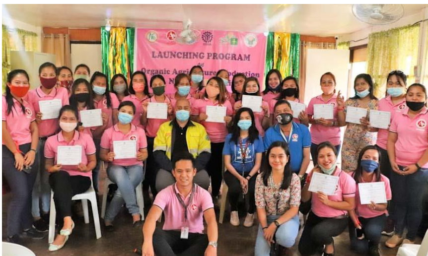
1 Scholars proudly show their scholarship certificates during the program launch. They are joined by key Agata officers who have pledged their full support.