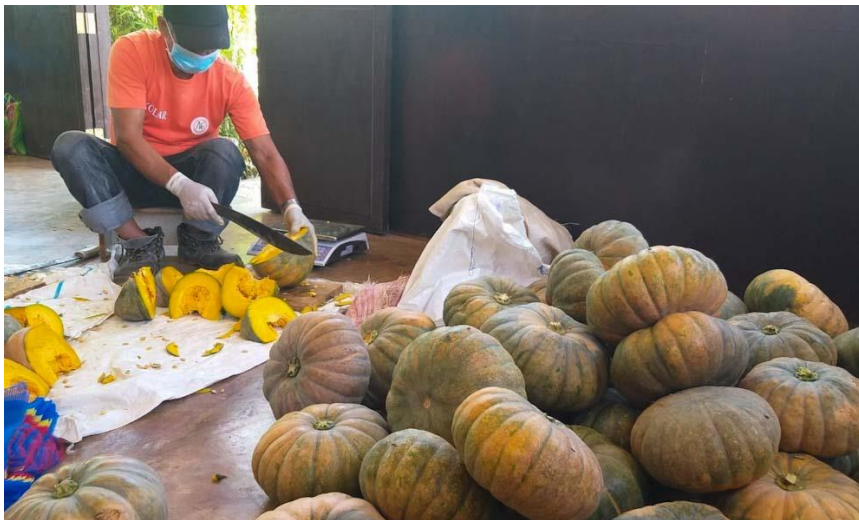
3 Equal portions. Fresh produce of kalabasa (squash) are portioned to fit specially-prepared food packs.