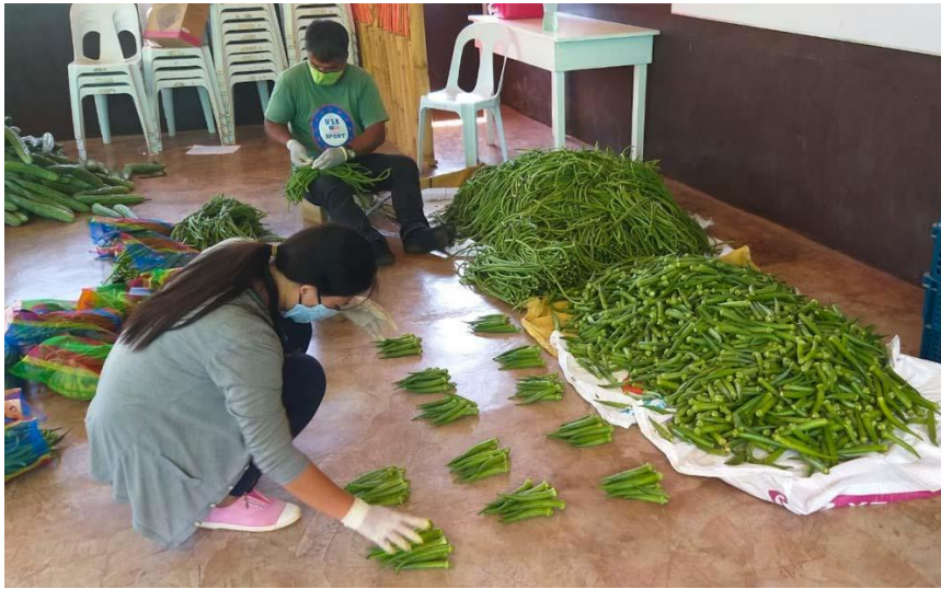
2 Agata personnel sort-out okras allocated for distribution to its eight beneficiary barangays in the towns of Tubay, Jabonga and Santiago.