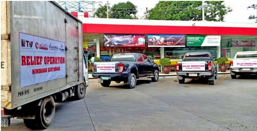
2 Supply convoy of TVIRD and Agata that delivered the goods to the affected far-flung areas of Magpet and Makilala, Cotabato.