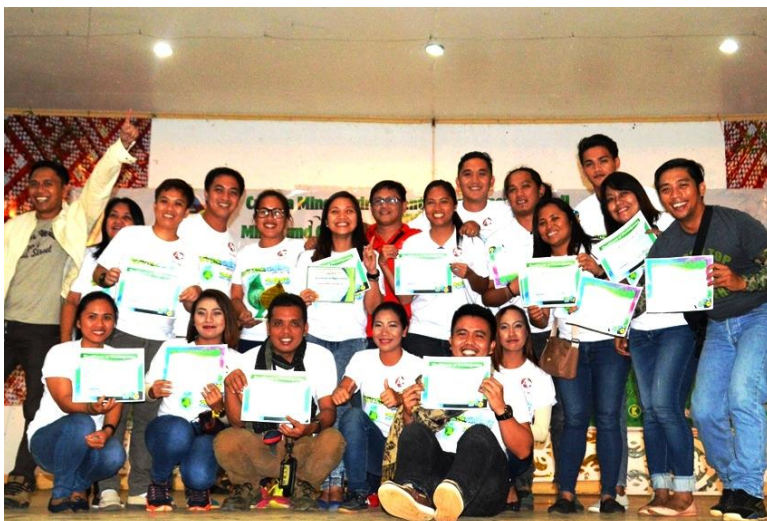
1 For the Win! The Agata Team receives the honor of being overall champion during the DENR-MGB's series of competitions to commemorate Environment Month 2016.