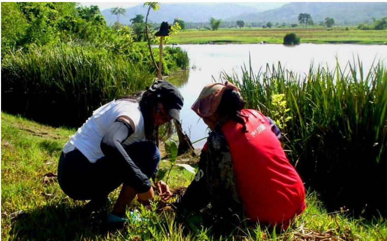
1 Planting twice as much. AMVI employees double-up on 'acts of green' during the company's Earth Day planting activity along Kalinawan River.