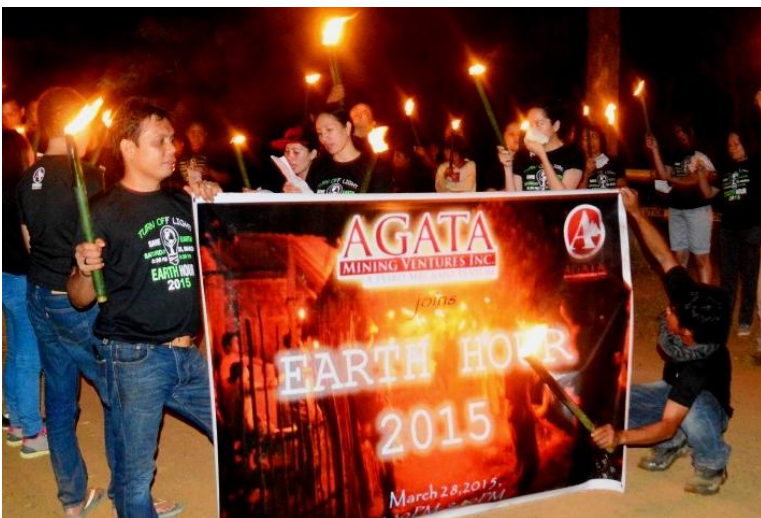
2 Mob culture. AMVI Employees stage an Earth Hour awareness parade in Barangay E. Morgado in Santiago.